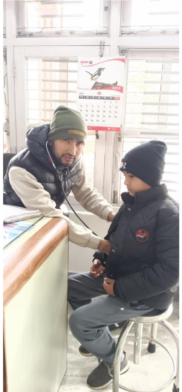
Children suffered by cold and flu.