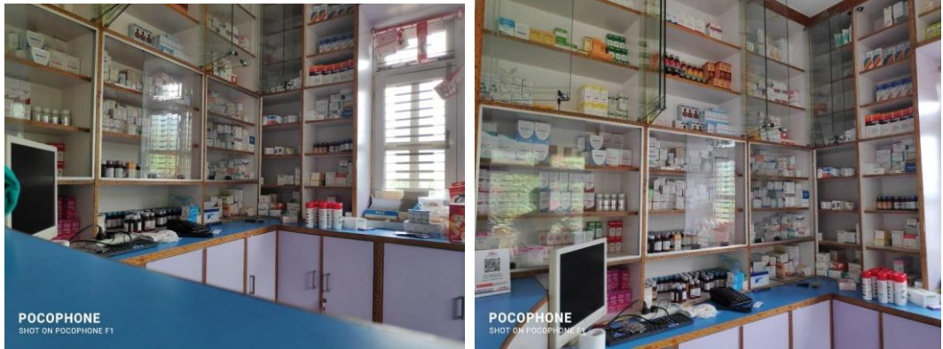
Medical of "Help to Help Nepal".