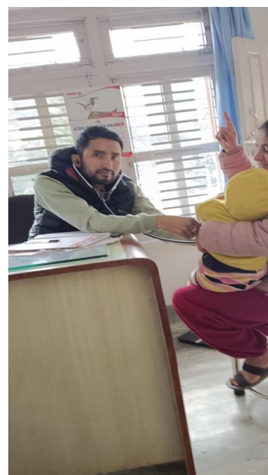
Checking Children Trauma Treatment