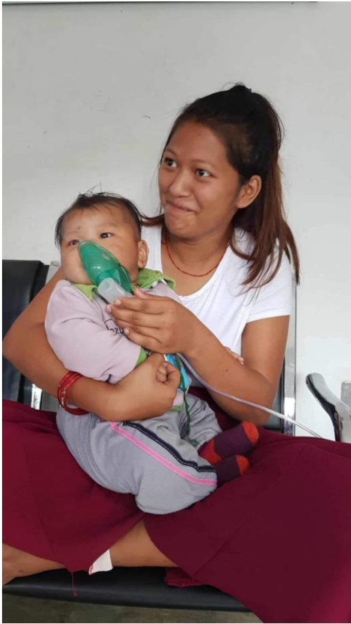
Smily mother with her baby after getting better treatment to her baby.