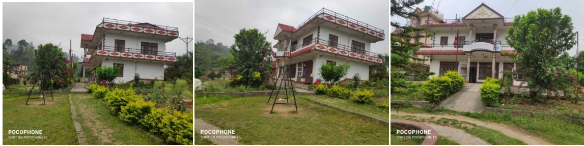
Main building of "HELP TO HELP NEPAL" hospital.