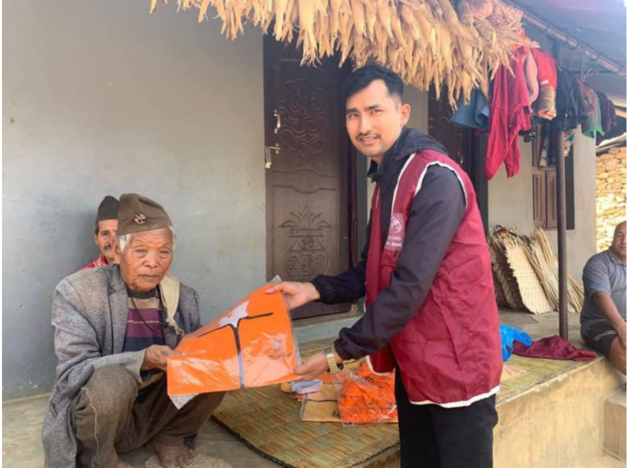
HELP TO HELP NEPAL: Cloths distribution Program.