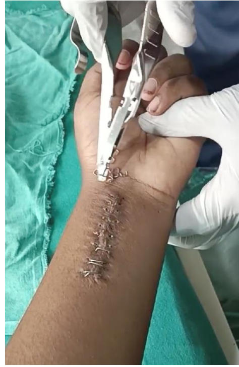
Stitching Accident Case