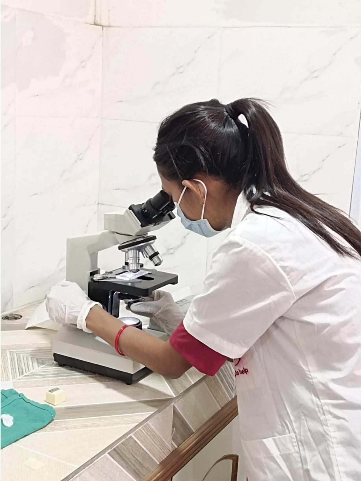
Lab technician finding something